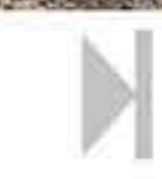
◀◀ Angle of View 39° Horizontal ( 50 mm Lens )