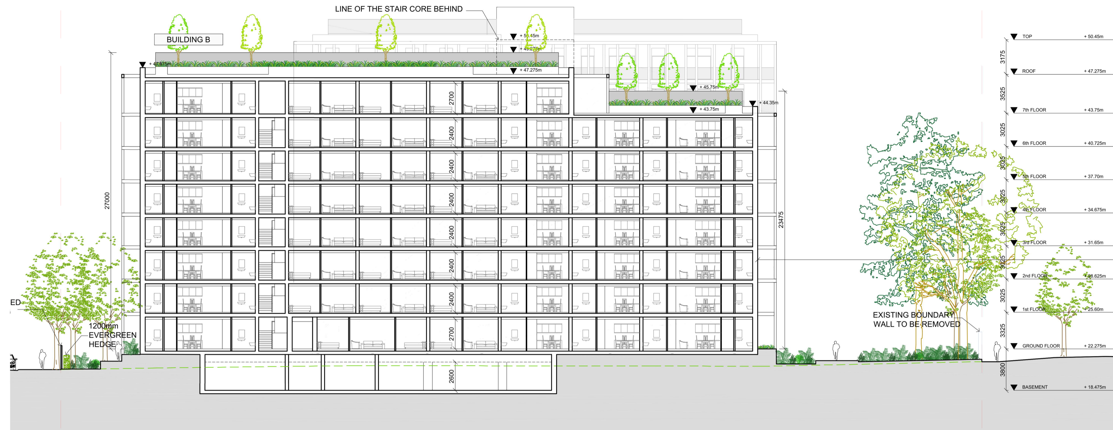
2 BLOCK B - EXISTING PLANNING SECTION BB Scale: 1 : 200