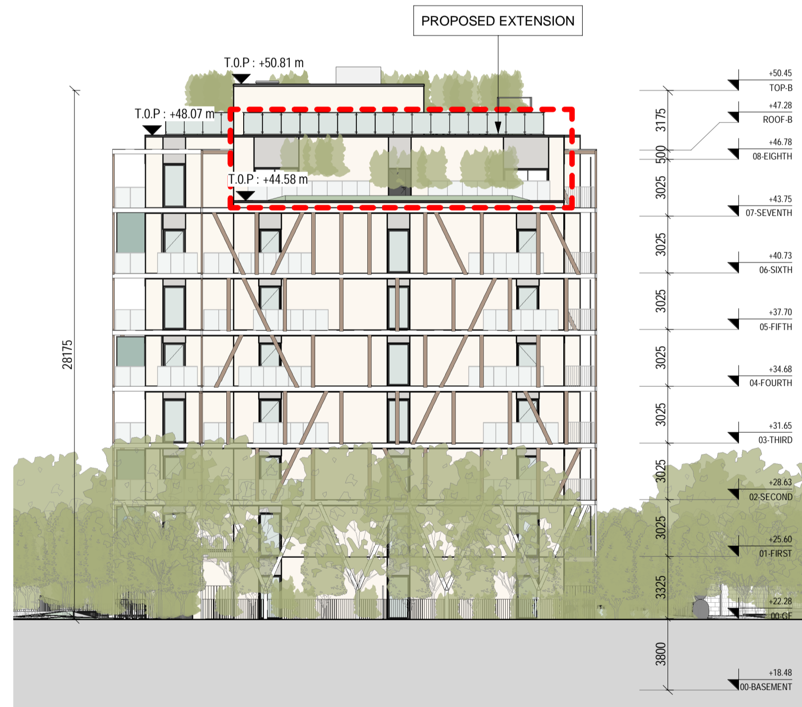
1 BLOCK B - PROPOSED PLANNING SOUTH ELEVATION 1.200 Scale: 1 : 200