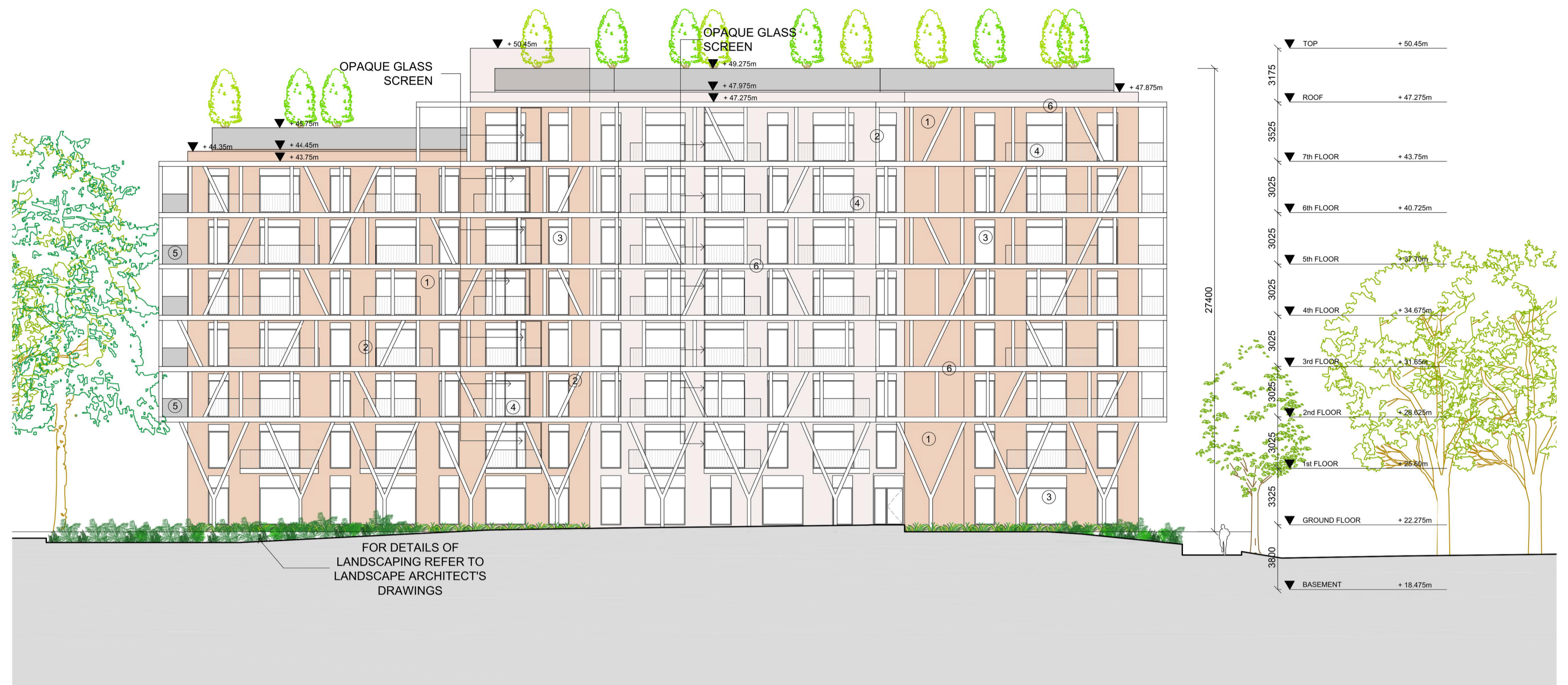
4 BLOCK B - EXISTING PLANNING EAST ELEVATION 1.200 Scale: 1 : 200