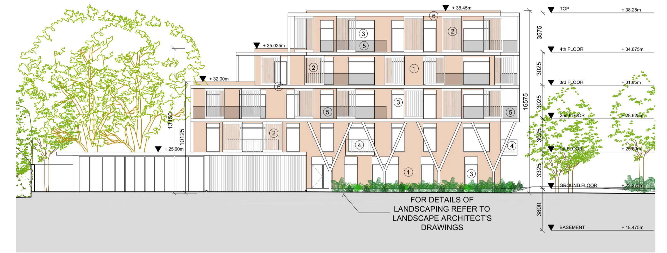
4 BLOCK A - EXISTING PLANNING SOUTH ELEVATION 1:200 Scale: 1 : 200