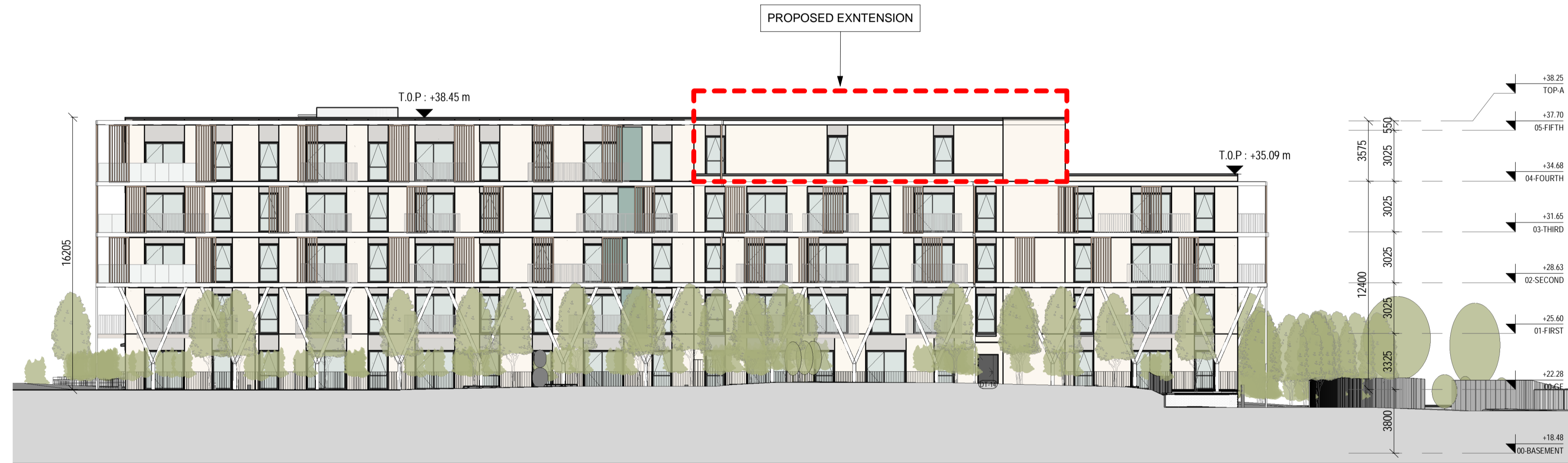
1 BLOCK A - PROPOSED PLANNING EAST ELEVATION 1:200 Scale: 1 : 200