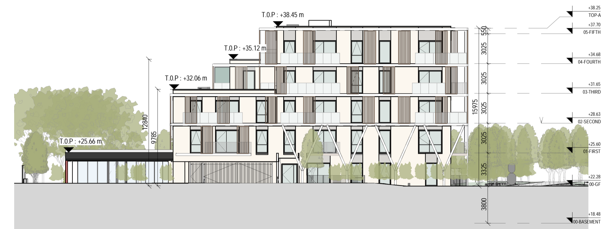
2 BLOCK A - PROPOSED PLANNING SOUTH ELEVATION 1:200 Scale: 1 : 200