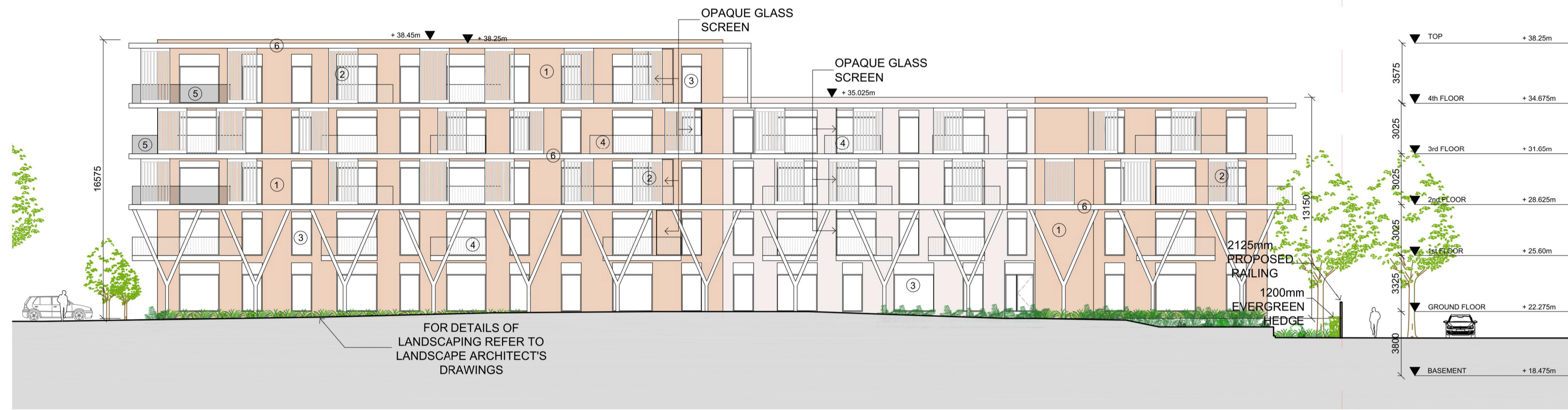
3 BLOCK A - EXISTING PLANNING EAST ELEVATION 1:200 Scale: 1 : 200